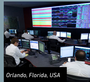
Orlando, Florida, USA